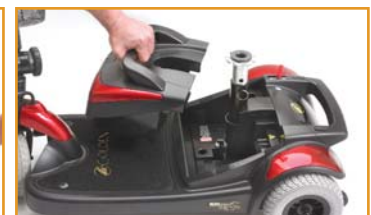
Step 2: Pull off the battery pack!