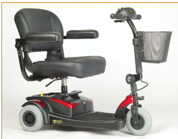
Upgrade to the new Stadium seat!

Wireless, quick disconnect in three easy steps: