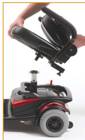
Step 1: Pop off the seat!