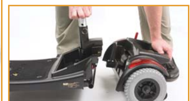
Step 3: Push apart the frame!