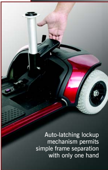
Auto-latching lockup mechanism permits simple frame separation with only one hand