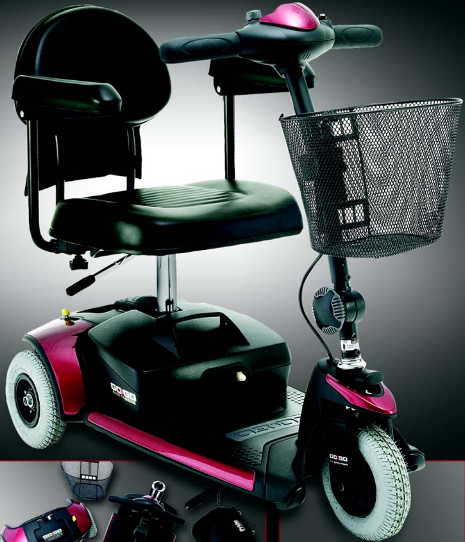
Go-Go Elite Traveller™ 3-wheel model shown with interchangeable Red shroud panels