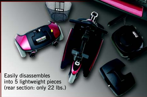
Easily disassembles into 5 lightweight pieces (rear section: only 22 lbs.)